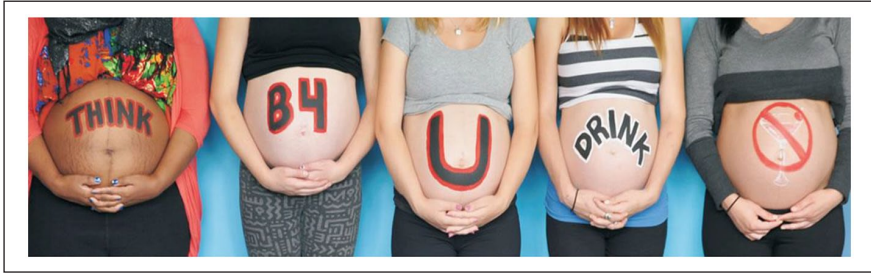
Figure 3. ‘Think Before You Drink’.